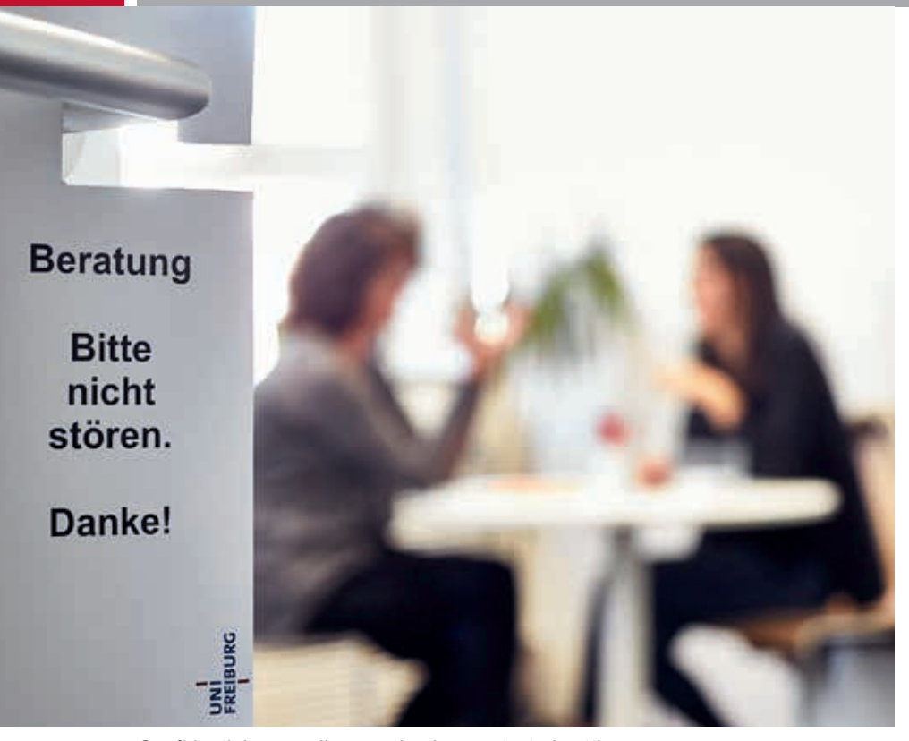
Confidential counseling session in a protected setting

This makes it all the more important for employees and students to know who they can turn to. Contacts and counseling services both at and outside of the university are available to provide you help, reassurance, and support and to show you ways to deal with the situation (see pp. 17). This can also be done subsequently or at a later point in time.